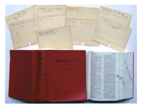
The Great Chinese-Japanese Dictionary This Dictionary has an electric version, and is ready for the third revision.

They are kept in Aichi University. In 1946, the teachers and the students of Toa Dobun Shoin divided up the student records and lists of grades and brought them back to Japan. There was no other Japanese university in a foreign country which brought all the student records and lists of grades back.